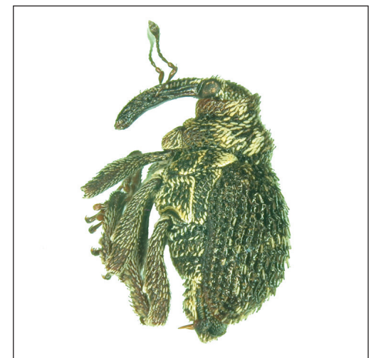
Scleropteroides longiprocessus Huang & Yoshitake, sp. n.