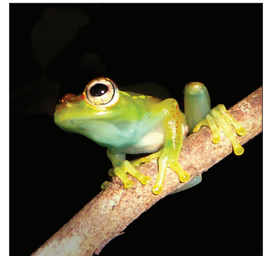
Boophis ankarafensis Penny et al., sp. n.