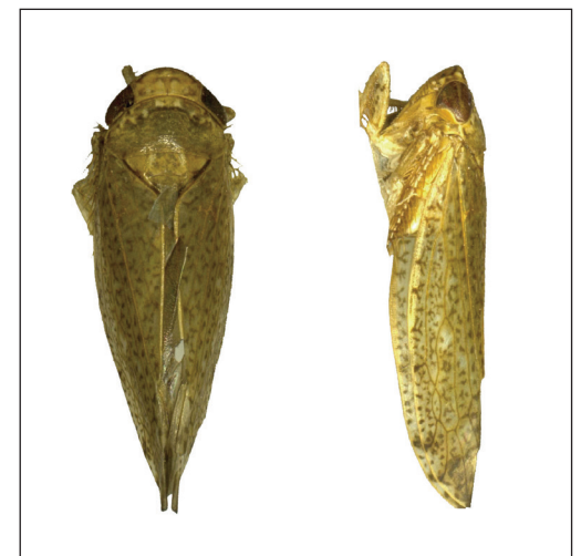
Tambocerus dentatus Qu & Dai, sp. n.