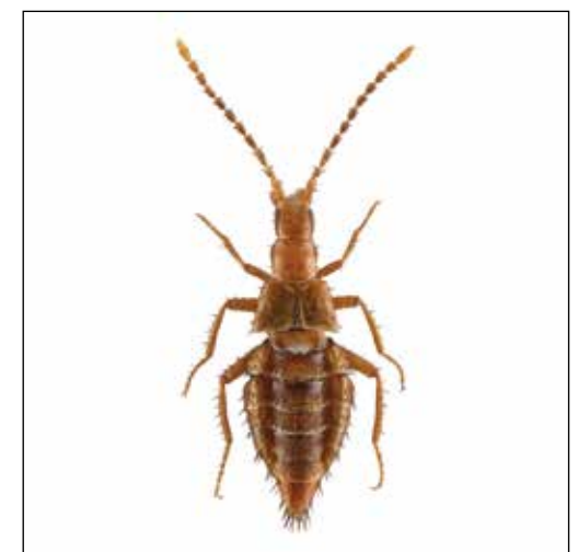
Dioxeuta yunnanensis Song & Li, sp. n.