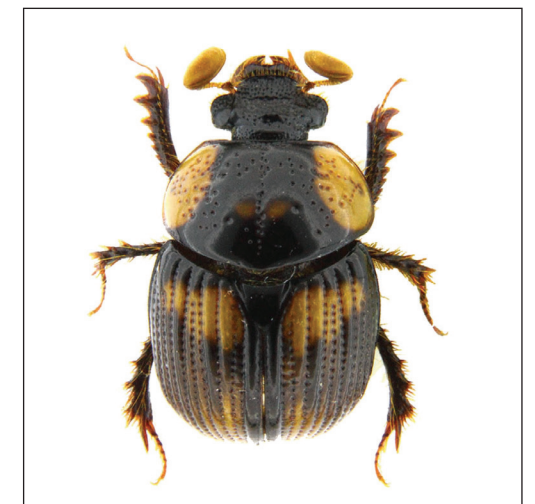
Bolbochromus malayensis Li & Krikken, sp. n.