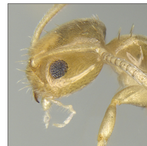
Paraparatrechina illusio LaPolla & Fisher, sp. n.