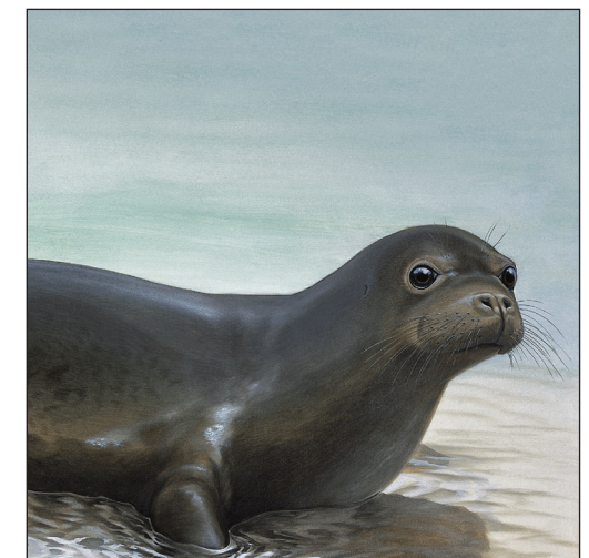
Monachus tropicalis (Gray, 1850) (credit: Peter Schouten)

ZooKeys Launched to accelerate biodiversity research