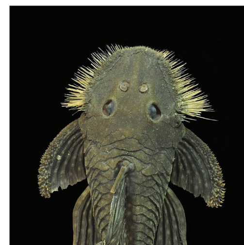
Pseudancistrus zawadzki sp. n.