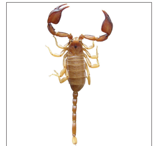
Euscorpius rahsenae Yağmur EA, Tropea, sp. n.