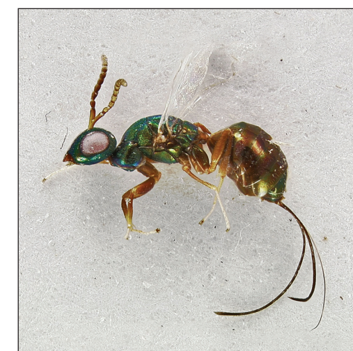
Pseudidarnes kjellbergi Farache & Rasplus, sp. n.