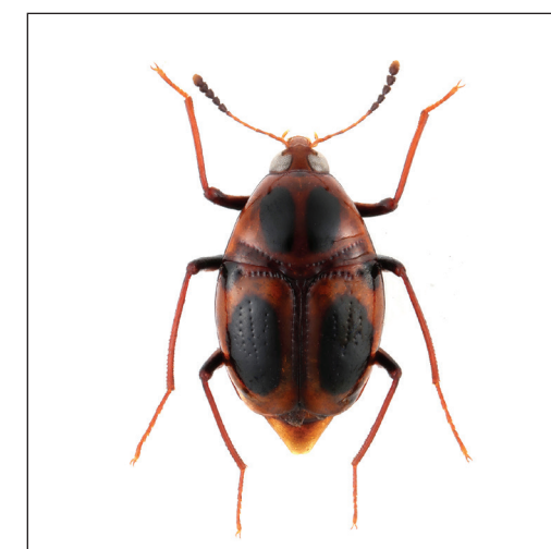
Scaphidium crypticum Tang, Li & He, sp. n.