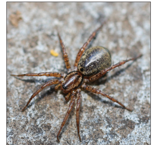
Copa kei Haddad, sp. n.

ZooKeys Launched to accelerate biodiversity research