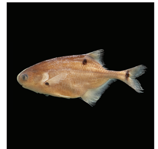
Petrocephalus arnegardi Lavoué & Sullivan, sp. n.