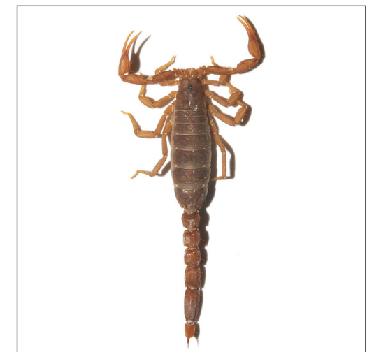
Vaejovis brysoni Ayrey & Webber, sp. n.

ZooKeys Launched to accelerate biodiversity research