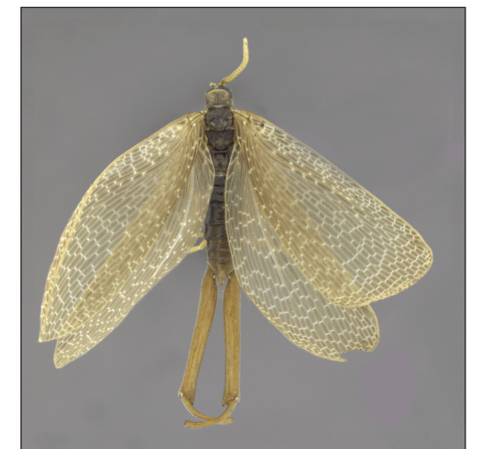
Austromerope brasiliensis sp. n.