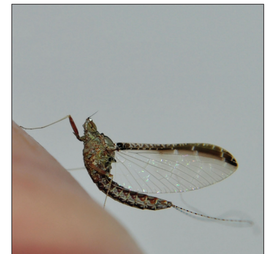
Cloeon smaeleni Lestage, 1924

ZooKeys Launched to accelerate biodiversity research