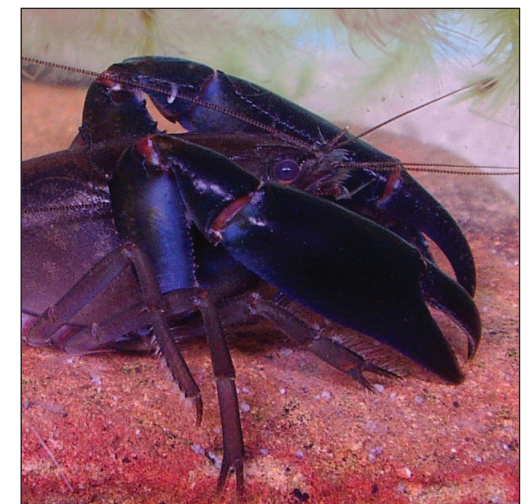
Gramastacus lacus McCormack, sp. n.

ZooKeys Launched to accelerate biodiversity research