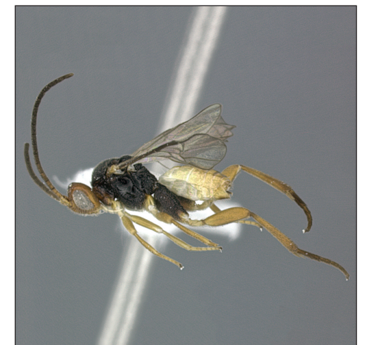
Wilkinsonellus corpustriacolor sp. n.