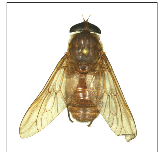
Elephantotus tracuateuensis Gorayeb, sp. n.