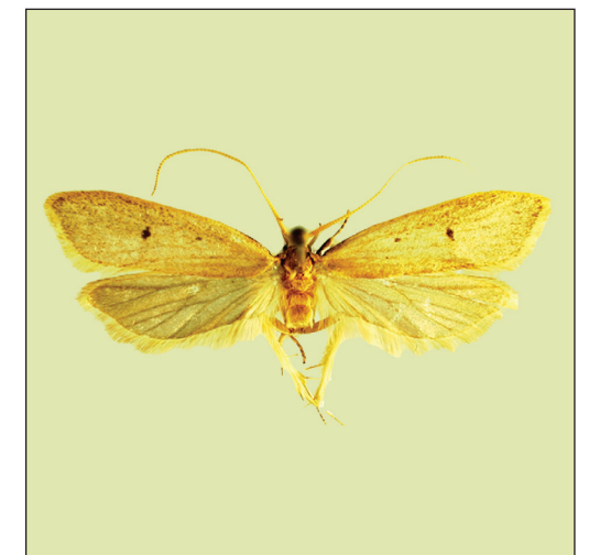
Lecithocera dondavisii Park, sp. n.