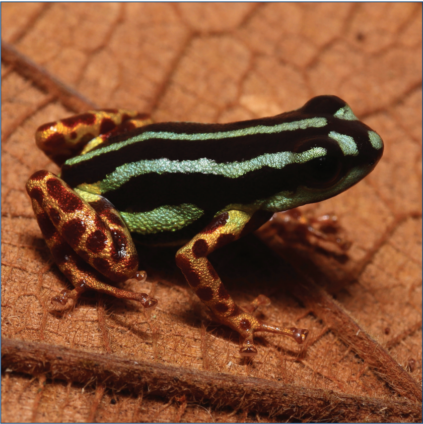
Ranitomeya aquamarina Mônico et al., sp. nov.