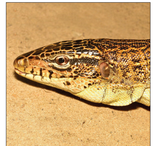
Tupinambis quadrilineatus Manzani & Abe, 1997