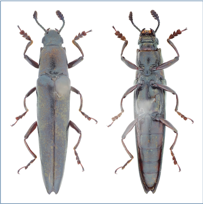
Labidolanguria liangi Huang, sp. nov.