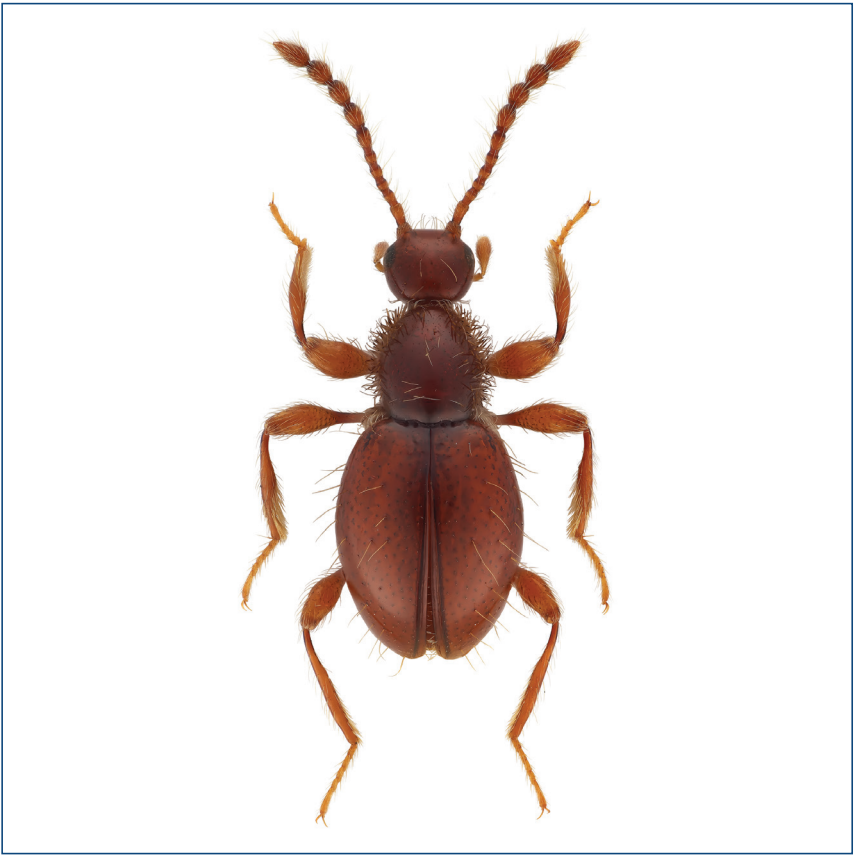
Euconnus (s. str.) imparitus Zi-Wei Yin, Ting Feng & De-Yao Zhou, sp. nov.