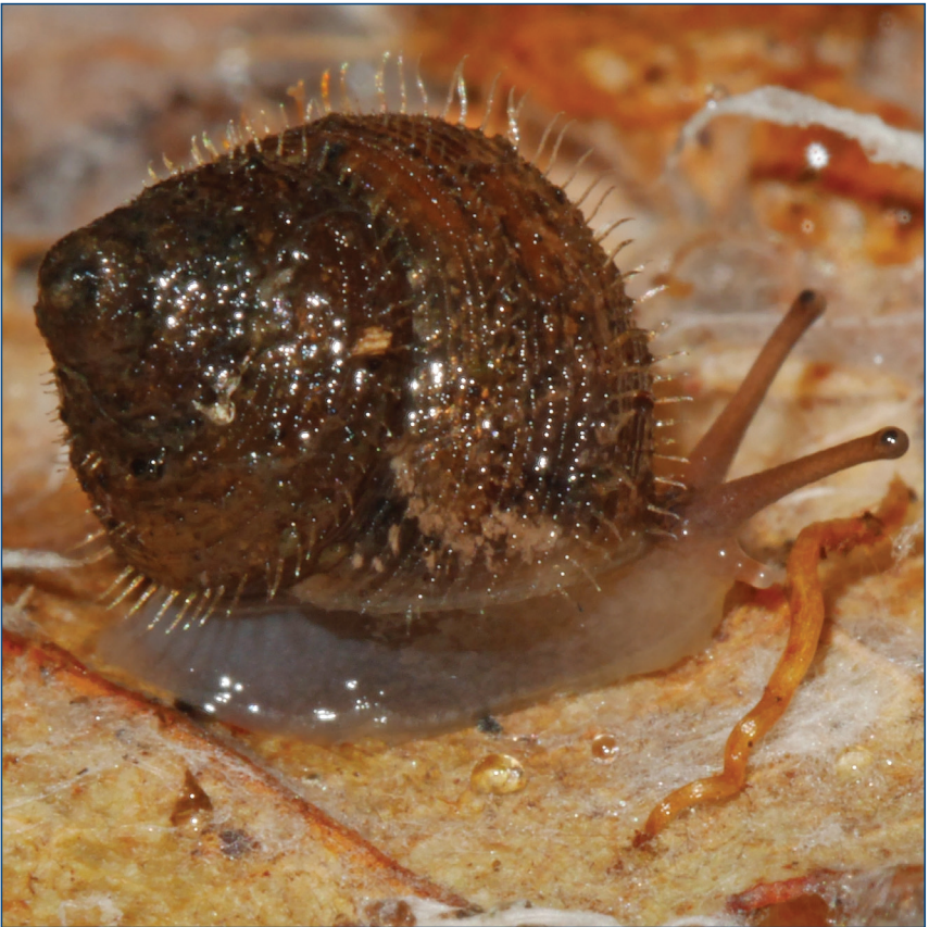
Protoglyptus bernicolae Gargominy, sp. nov.