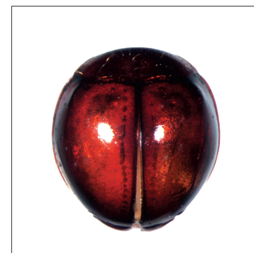
Microserangium erythrinum Wang & Ren, sp. n.