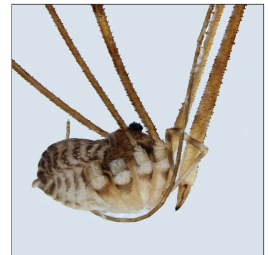
Megalopsalis porongorupensis (Kauri, 1954), comb. n.