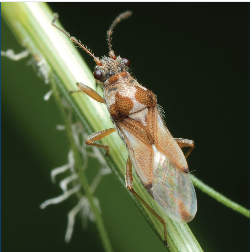
Ninomimus flavipes (Matsumura, 1913)