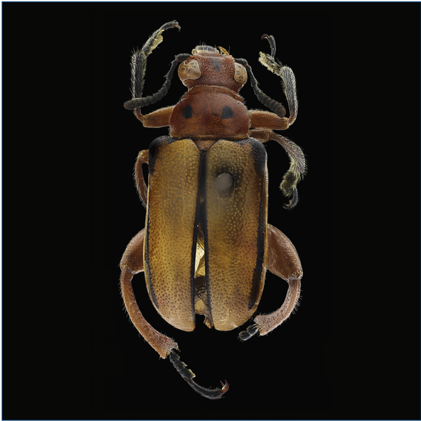
Agathomerus santiagoi Rodríguez-Mirón & López-Pérez, sp. nov.

A peer-reviewed open-access journal ZooKeys Launched to accelerate biodiversity research