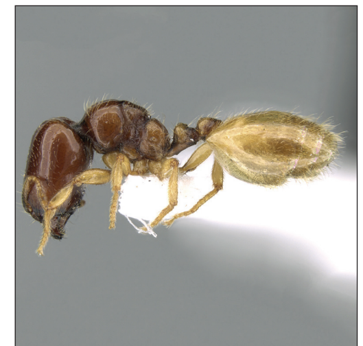
Carebara fayrouzae Sharaf, sp. n.