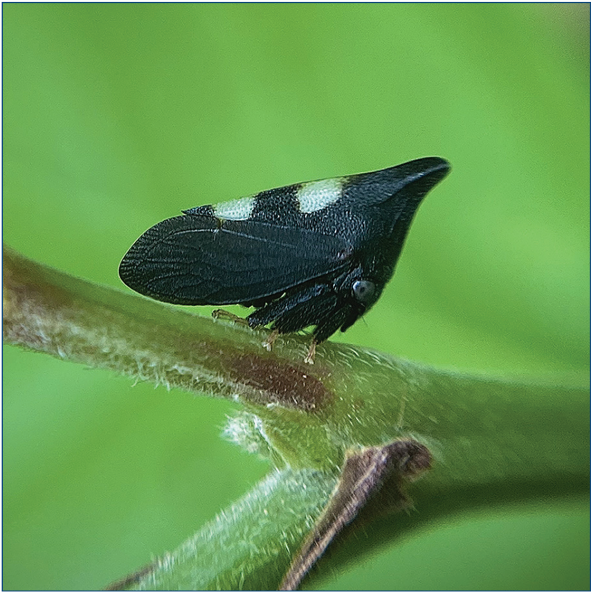
Enchenopa gennya Rueda-Rodríguez & Montalvo-Salazar, sp. nov.