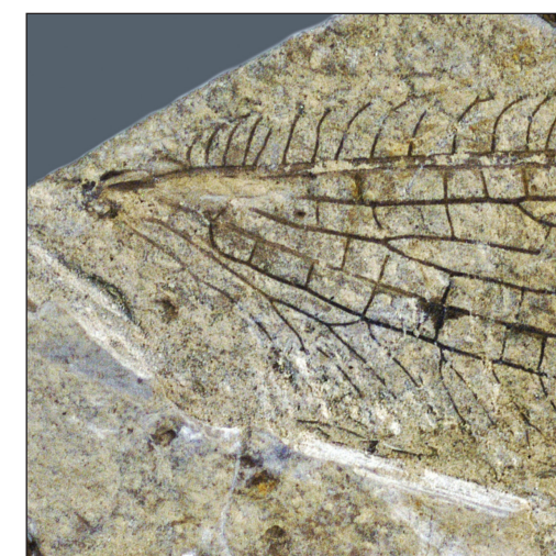
Daonymphes bisulca sp. n.