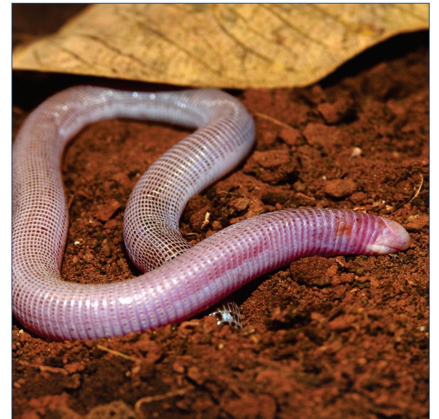
Amphisbaena amethysta Síría Ribeiro et al., sp. nov.