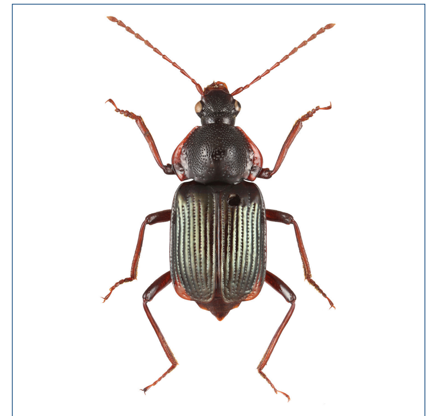
Apatetica angusticollis Chang, Schillhammer & Tang, sp. nov.