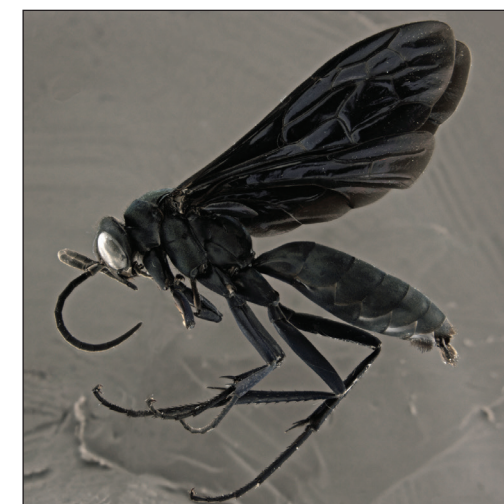
Abernessia capixaba Waichert & Pitts, sp. n.