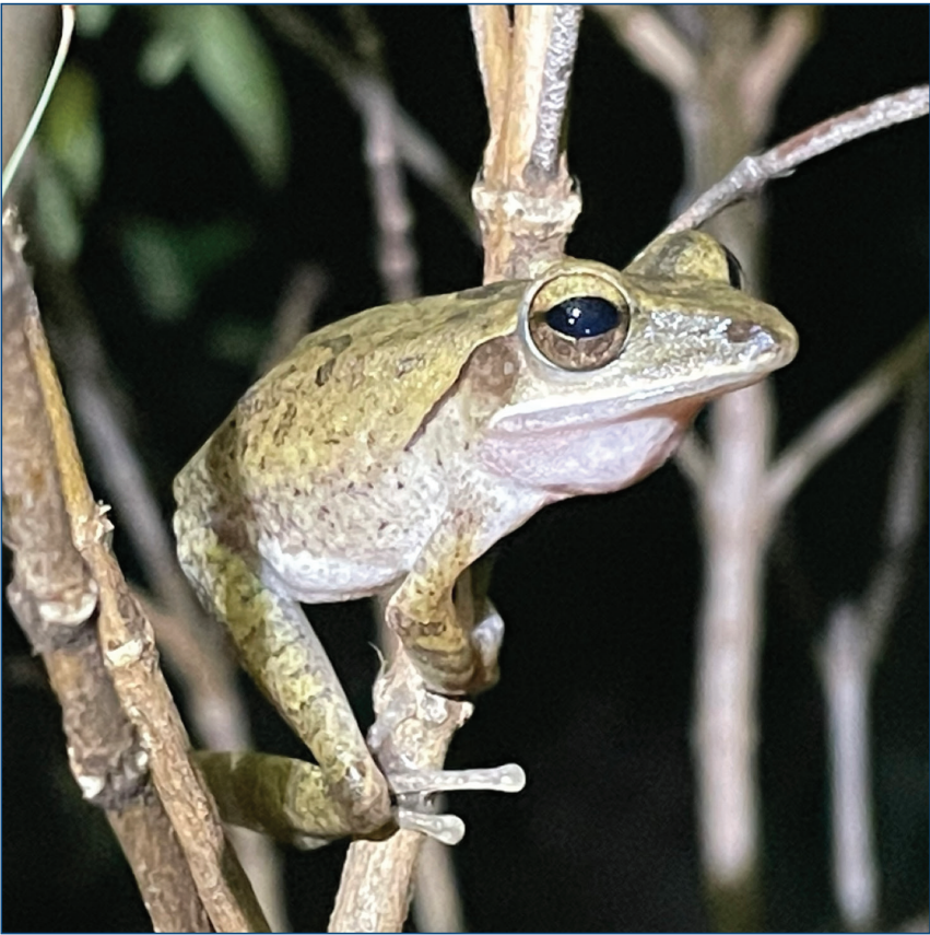
Polypedates leucomystax (Gravenhorst, 1829)