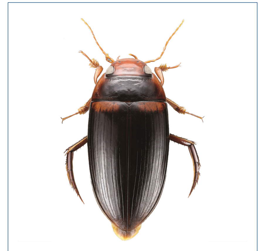
Austrelatus inconstans Helena Shaverdo et al., sp. nov.

A peer-reviewed open-access journal ZooKeys Launched to accelerate biodiversity research