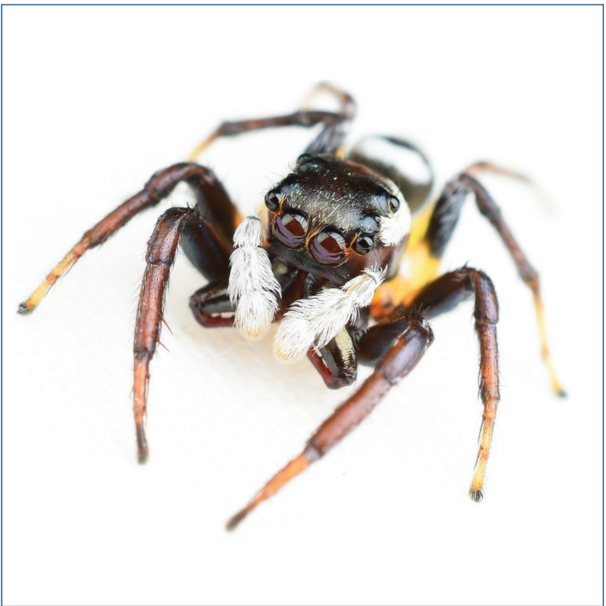
Cheliceroides longipalpis Żabka, 1985