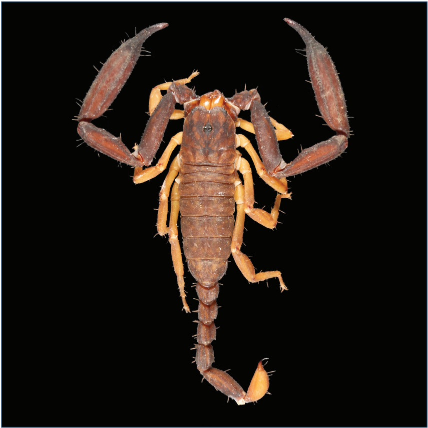
Scorpiops (Euscorpiops) krachan Wasin Nawaneti Wong et al., sp. nov.