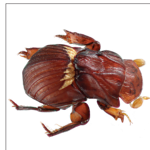
Termitotrox cupido Maruyama, sp. n.