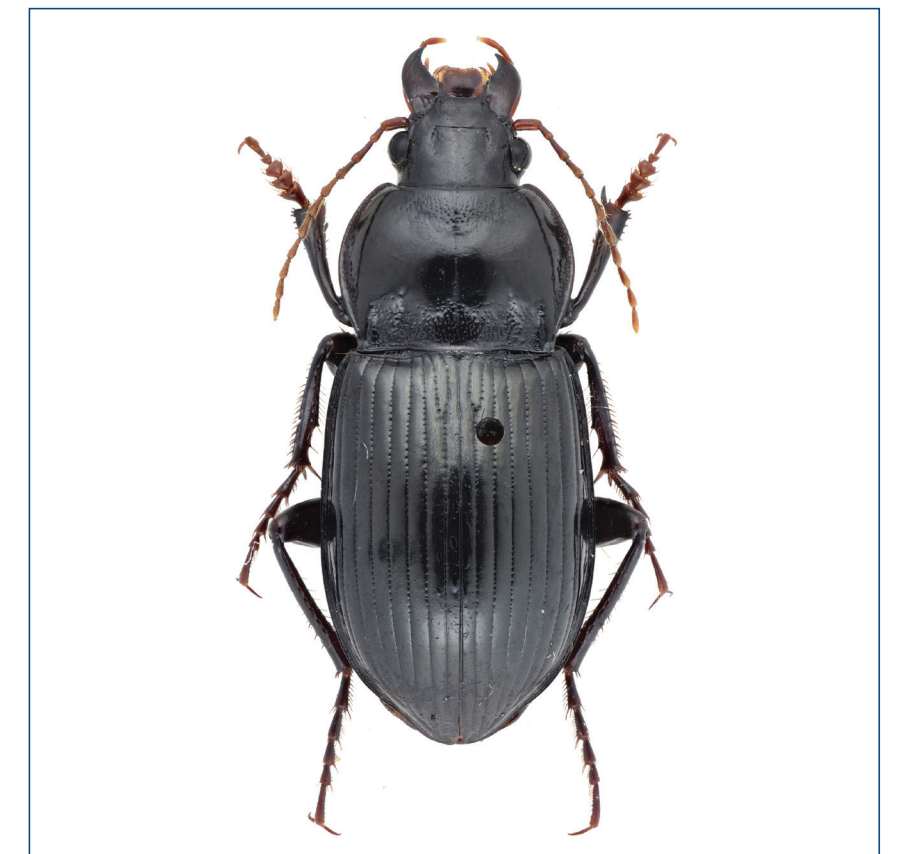
Amara ( Curtonotus ) beijingensis Yihang Li et al., sp. nov.