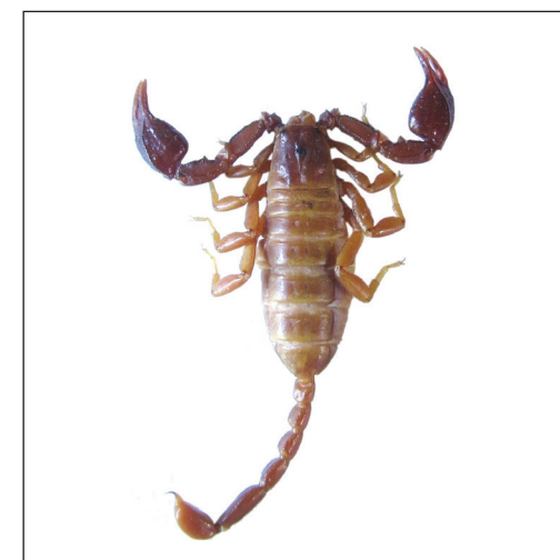
Euscorpius lycius Yağmur, Tropea & Yeşilyurt, sp. n.