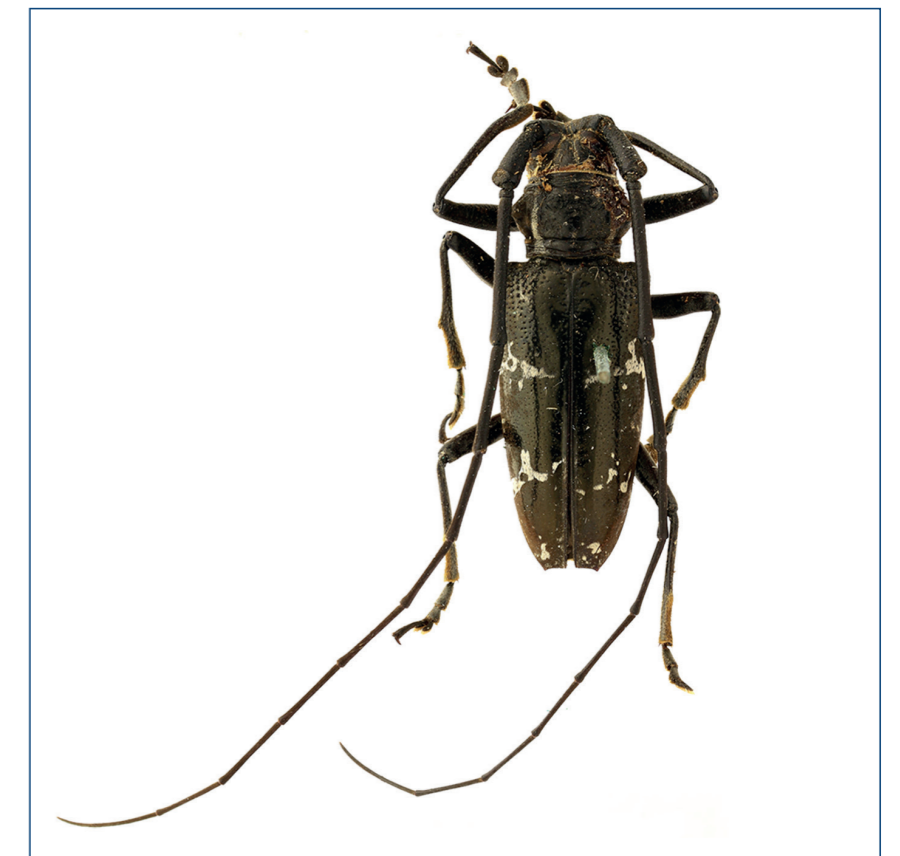
Epepeotes desertus obscurus (Aurivillius, 1926)