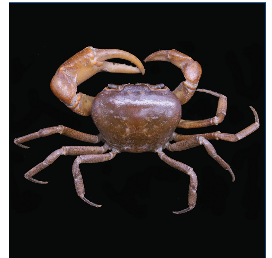
Songpotamon funingense Boyang Shi et al., gen. et sp. nov.