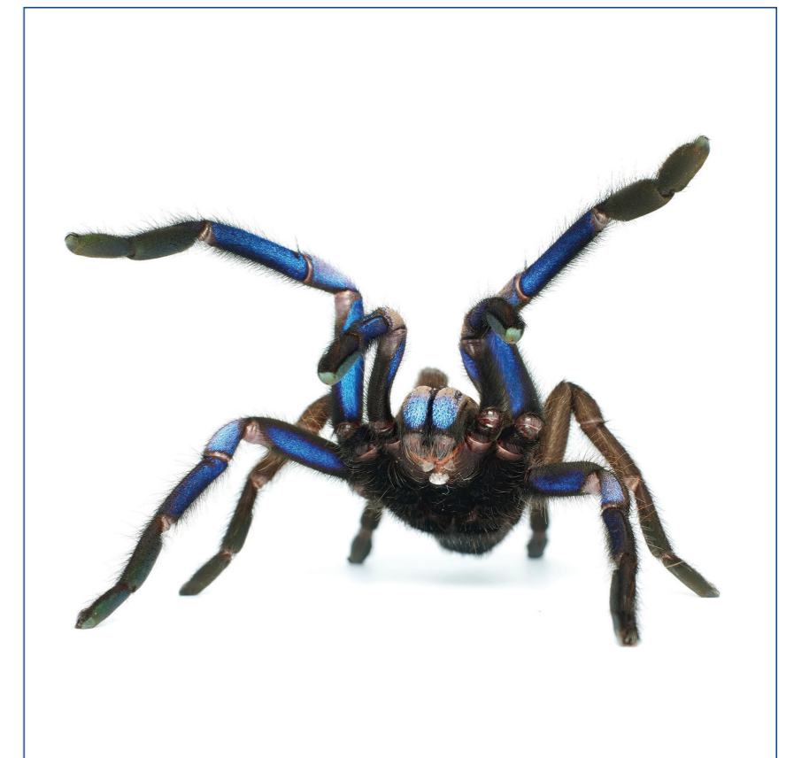
Chilobrachys natanicharum Chomphuphuang et al., sp. nov.