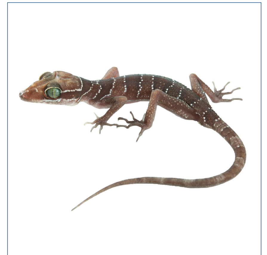
Cyrtodactylus wangkhramensis Korkhwan Termprayoon et al., sp. nov.