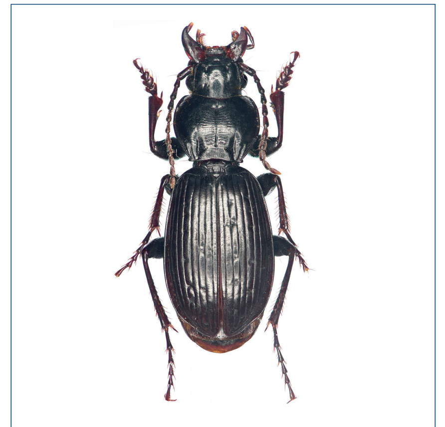
Pterostichus (Orientostichus) pemphis Wenqi Yin et al., sp. nov.