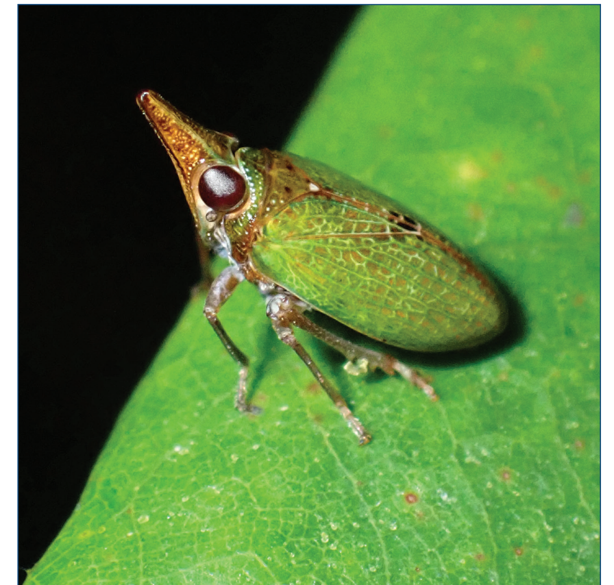
Laohiracia acuta Constant, 2021