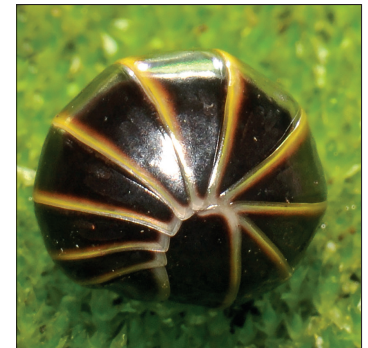
Hyperglomeris bicaudata Likhitrakarn, sp. nov.