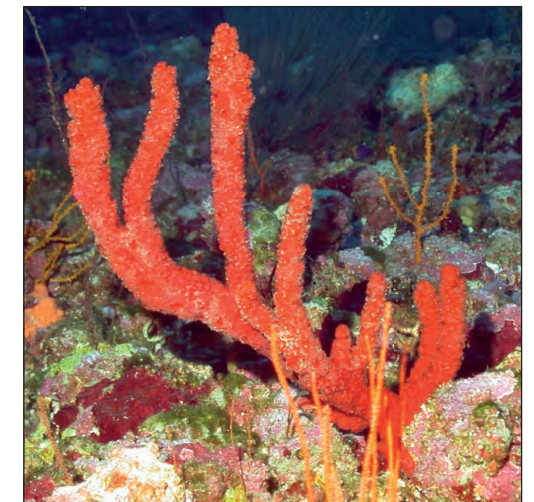
Pilocaulis cf. walpersii (Duchassaing & Michelotti, 1864)

ZooKeys Launched to accelerate biodiversity research